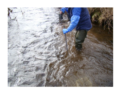
Securing an artificial redd in the substrate on the river Bunowen, County Galwyay.

Two sub-catchments on the River Suck were eventually selected for the common