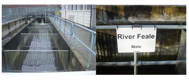
Eggs were placed into aluminium envelopes (horizontal units in photo above) which were then slotted into aluminium frames. Below: holding facilities in the ESB Parteen Hatchery, County Tipperary.

ried out before the eggs were inserted into the rivers.