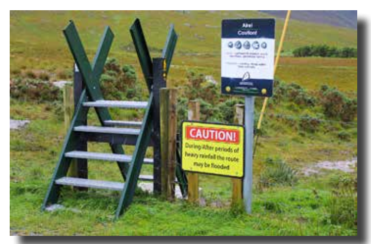
New stiles made from aluminium (top) and recycled plastic (bottom).

The continued upgrade of our Stiles and footbridges from old wooden structures to new aluminium and recycled plastic ones was on going throughout the year along with bank restoration and general maintenance of the fishery. New signage was also put in place along the fishery drawing attention to the possible hazards to anglers and the general public.