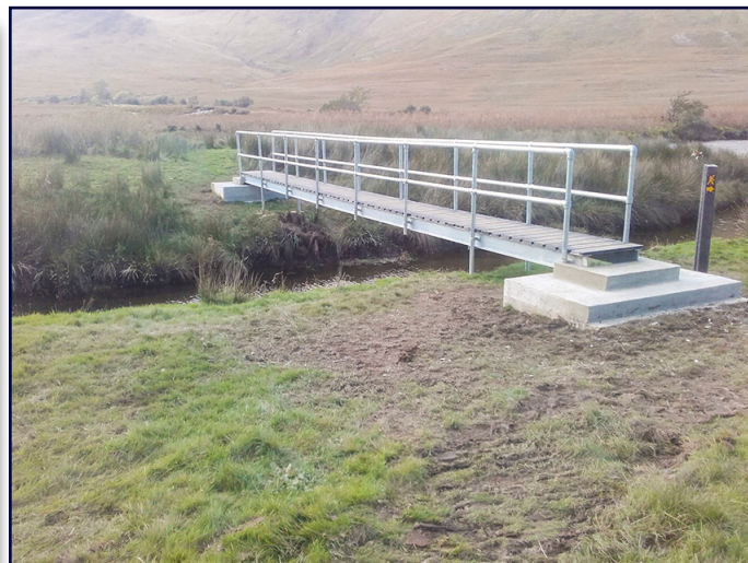
New footbridge erected between Beats 7 and 8.