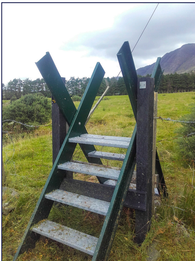
New aluminium stile

New stiles and footbridges have been erected by IFI and Community Scheme staff members where needed, and this will continue until all have been replaced.