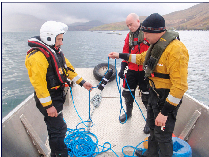
IFI staff deploying mooring and acoustic receiver as part of the SMOLTRACK project.