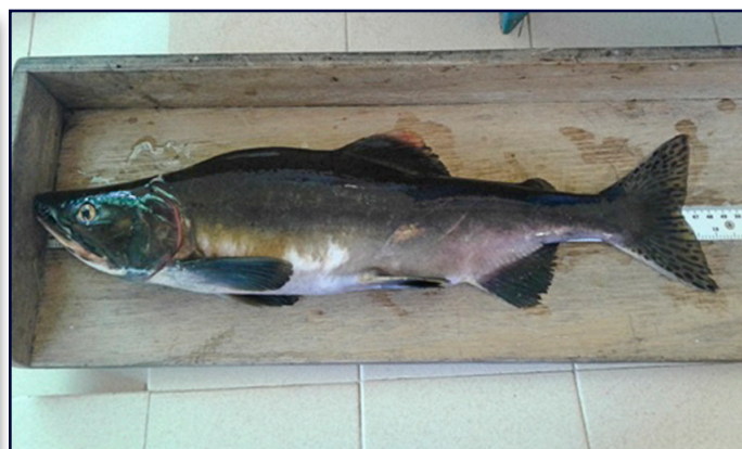
1.91lbs pink salmon caught on Beat 9 on the Erriff 09/08/17

https://www.youtube.com/watch?v=jVVU3GGfcy8