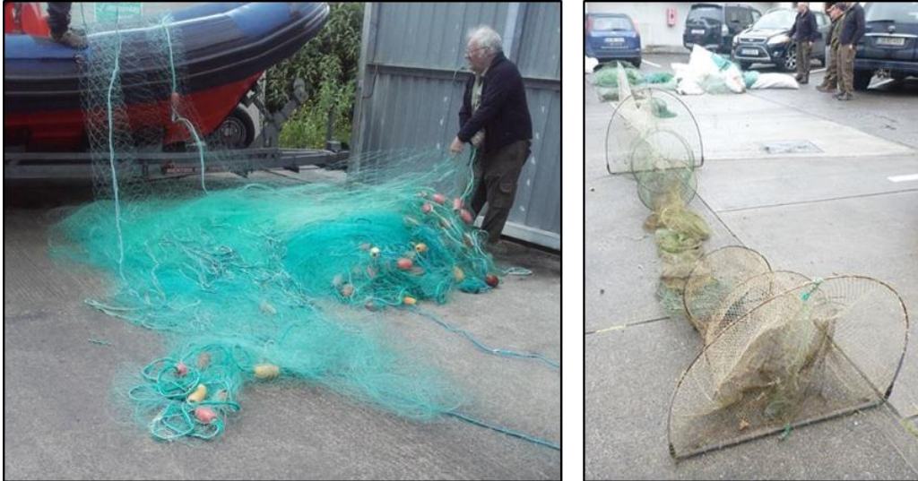
Figure 5 & 6 : Staff unloading 900m of drift net seized at sea off Porturlin in Co. Mayo in June (left) and one of two 25m fyke nets seized from a concealed location on the shores of Lough Conn at Pontoon (right).

An extensive range and number of items were seized during 2016 ranging from fishing rods, dinghies, spears, hand lines and nets. In total 1,487 illegal fishing items were seized which included 301 nets measuring 14,782m.