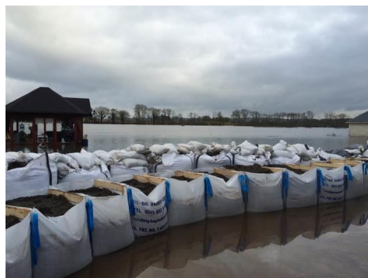
Figures 3 & 4: Emergency sand bagging works at houses in Castleplunket (left) and Athleague (right). IFI staff helped out with these defense efforts at numerous locations. These are Turlough areas that filled/rose to unprecedented levels.