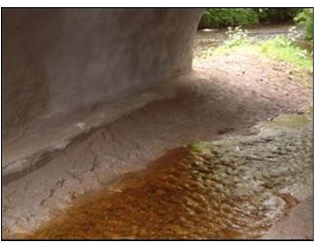
Gunite rebound on a stream bed where no precautions were taken to prevent its entry to waters. Rebound having a pH >11.5 would have entered the actively flowing stream with dire environmental consequences.

10.5 Where a single arch structure is under repair, to achieve grouting in the dry, water may be diverted from upstream to downstream by means of a secure flume arrangement, or through piping, or in very limited circumstances, by means of over pumping. Screening to preclude entry of aquatic life to pumps must be carried out.