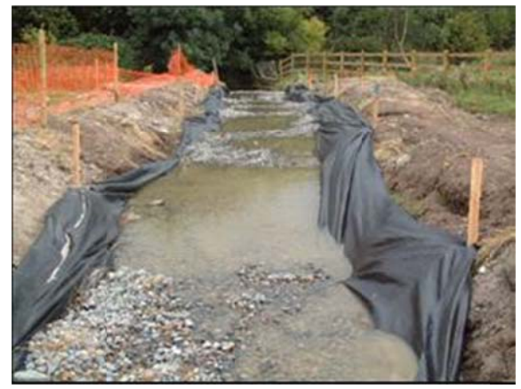
Terram lined (to prevent erosion) silt control pond outlet channel showing gravel acting as filter medium for silt removal.