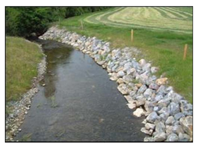
The boulders in these bank protection works are not large enough, not sunken below stream bed level and likely to be undercut and dislodged in a storm event.

level and securing them into their final position. In areas of high water energy, to ensure stability, boulders size should be a minimum of 0.5 ton.