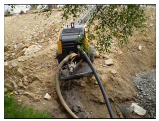
Drip tray is undersized, dangerously positioned and leaking oil. Unacceptable practice.