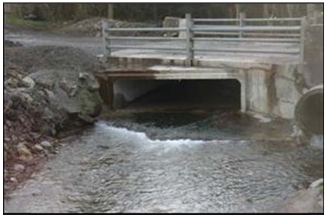
Box culvert positioned at incorrect level. Upstream fish passage is made difficult. Culvert invert should be 500 mm. below existing bed level and back filled with clean gravel to match the existing stream profile.