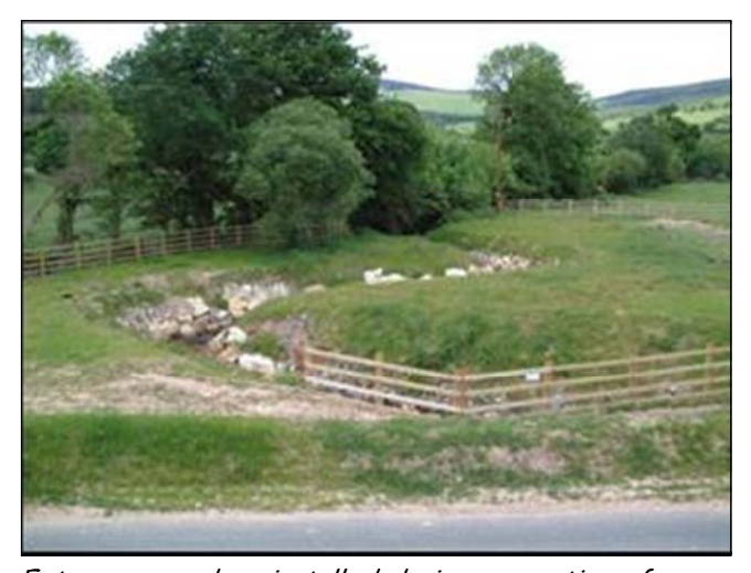
Extreme meanders installed during excavation of a new channel to overcome excessive gradient between the original course of the stream (in the background at tree line) and the point of entry of the newly created channel to a culvert (in foreground under the timber fencing). In this instance there was inadequate provision at the planning and design stage for the necessary land take.

9.6 Where temporary short term by-pass channels are required for a number of days, these shall be excavated and sized such as to accommodate such flood event as might reasonably be expected over the period in question.