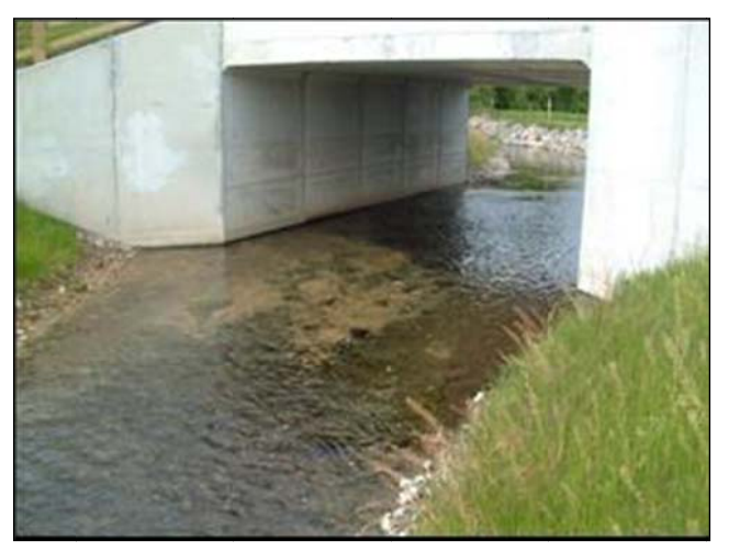
Excessively wide culverts can result in reduced current speed, ponding, and siltation of instream gravels.

6.2 Culverts are the most frequently used river/stream crossing structures and associated with some of the most common fish passage problems. The culverting of long stretches of fisheries water is extremely undesirable and can result in significant loss of valuable habitat. In the case of crossing structures over fishery waters, the preferred position is for clear span structures (bridges), so as not to interfere in any way with the bed or bank of the watercourses in question.