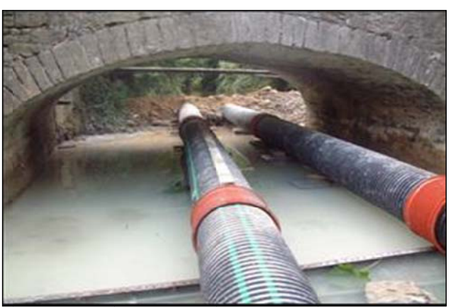
Repairs to a single arch bridge and scour slab with stream flow piped from upstream to downstream (foreground) during both grouting and slab repair.

10.2 The concerns as regards sensitivity of aquatic life to pollutants and physical disturbance set out earlier in this document all apply, particularly as regards loss of grout and gunite rebound, both of which are highly alkaline.