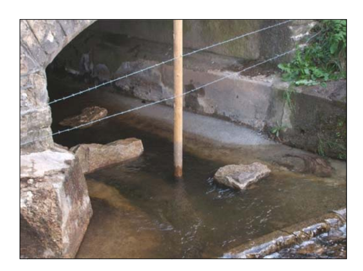
Large stone baffles held in position on concrete apron with stainless steel dowel rods drilled into both the apron and stones. (Poor placement of the livestock fencing as shown in the photograph has the potential to cause blockage by catching debris.)

10.12 The installation of baffles can assist where excessive water velocity over an apron/scour slab prohibits free upstream fish movement. Baffles should be positioned so as to reduce velocity and provide temporary rest areas for weaker fish attempting to swim upstream.