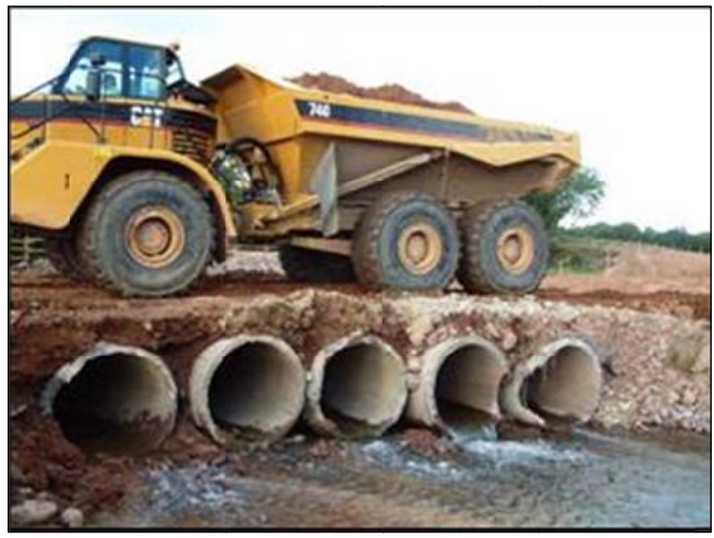
The same temporary crossing location as shown on the previous page, but with a laden dumper dislodging and causing loss of cover material to waters.