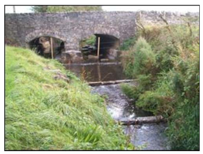
Low level stone weirs installed on a salmonid nursery stream to back water the bridge apron /scour slab originally installed at too high a level.

10.8 Repairs to bridge aprons/scour slabs must be undertaken so as to ensure upstream and downstream passage of fish is possible in all flow conditions. Particular care must be exercised to ensure perching does not result where new concrete slabs are poured.