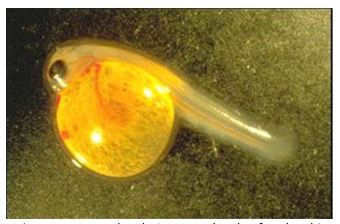
A brown trout at the alevin stage shortly after hatching. This life stage is very sensitive to pollution and physical disturbance.

1.3 These guidelines identify the main issues of concern in terms of construction impacts and their prevention. They set out inter alia requirements in relation to bridges and culverts and the need for such structures to allow for unhindered upstream and downstream movement of fish and aquatic life.