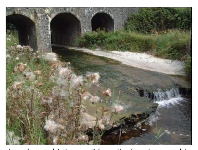
Apron/scour slab inaccessible on its downstream end to fish life because of the extent of perching and impassable due to a combination of excessive water velocity and lack of water depth across its surface.

10.6 In all instances of guniting and repair works including repointing and masonry cleaning, the entirety of the area of water over which works are taking place should be protected from gunite rebound, mortar and vegetation loss by installation of a sealed and secure decking which shall extend upstream and downstream the structure concerned so as to ensure no losses to water.