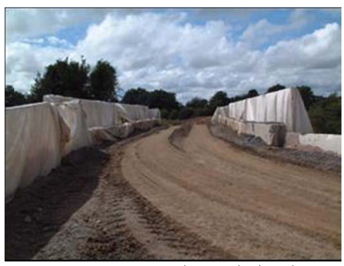
A crossing structure over a designated salmonid water. Note: terram covered fencing, reinforced concrete traffic barriers and fall back from the watercourse.

5.11 It is not permissible, except in exceptional circumstances, to reposition temporary crossing structures where these are not of a clear span type.