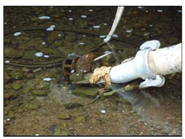
Continuous abstraction using submersible pump. No screening in place to prevent the entry of e.g. juvenile fish species to the pump. Unacceptable practice.

persons and property, that dust control measures sometimes may be required. This is normally achieved by abstraction from watercourses adjacent to the site of earthworks. In such circumstances it is essential that the aquatic resource is protected and that over-abstraction does not take place especially in low flow summer conditions at locations supporting important fish populations.