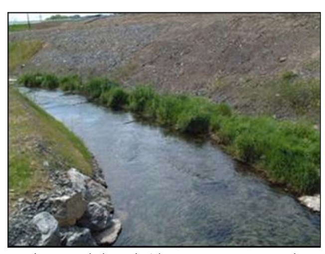
Newly created channel. The riparian grasses on the right bank have been transferred from the previous course of the now redundant original channel. The root structures stabilise the bank area while the grasses provide a degree of cover and shade and provide habitat for aquatic insects which form part of the food for fish.