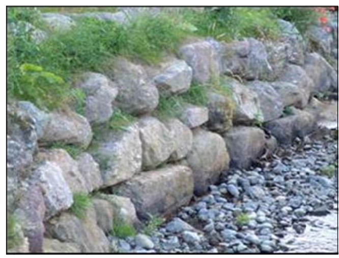
Revegetation of rock armour facilitated by the placing of locally sourced topsoil (to ensure no importation of non local grasses and shrubs) between each layer or course of boulders at installation time.

6.14 To facilitate revegetation, each course of boulders laid should be back filled with a layer of top soil. Selection of boulders in terms of shape to facilitate their placement and stability is a major consideration. Irregularly shaped boulders are very difficult to work with in terms of building multiple stable courses.