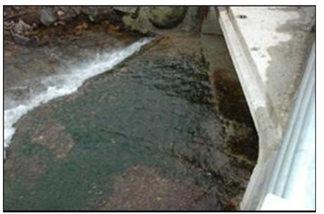
The smooth concrete finish is totally unsuitable for fish passage.

6.12 Pipe culverts are not generally considered acceptable on fisheries waters. They are normally only appropriate for use on minor watercourses and drainage ditches where these can be demonstrated as not being significant in terms of fisheries habitat.