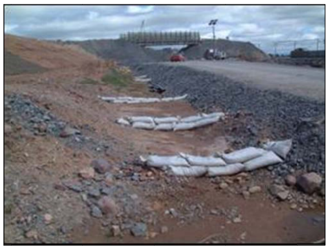
Silt discharge minimisation by providing retention areas to reduce discharge velocity and allow settlement during rainfall events.

7.3 Discharges of fuels and oils can be directly toxic to aquatic life and at sub lethal levels lead to tainting of fish tissues, rendering fish inedible. Oil films on water can seriously interfere with the diffusion of oxygen from the atmosphere into waters and in extreme cases result in oxygen depletion.