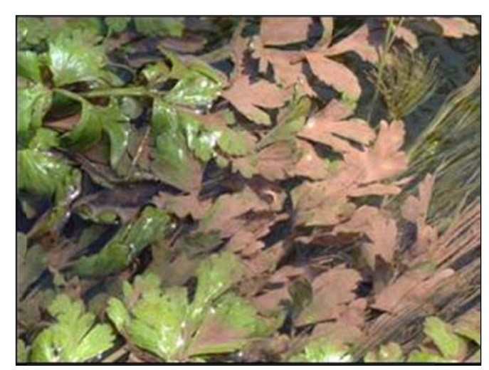
The practical impact of poor silt control.

7.3 Discharges of fuels and oils can be directly toxic to aquatic life and at sub lethal levels lead to tainting of fish tissues, rendering fish inedible. Oil films on water can seriously interfere with the diffusion of oxygen from the atmosphere into waters and in extreme cases result in oxygen depletion.