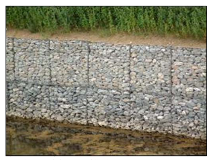
Visually unsightly stone filled gabion baskets.

6.15 The height to which rock armour is built must take account not only of the riparian zone requiring protection, but also in certain circumstances of the need to protect e.g. kingfisher and sand martin habitat. In many instances, one or two layers of armour will be sufficient to protect and stabilise the toe of embankments while allowing nesting.