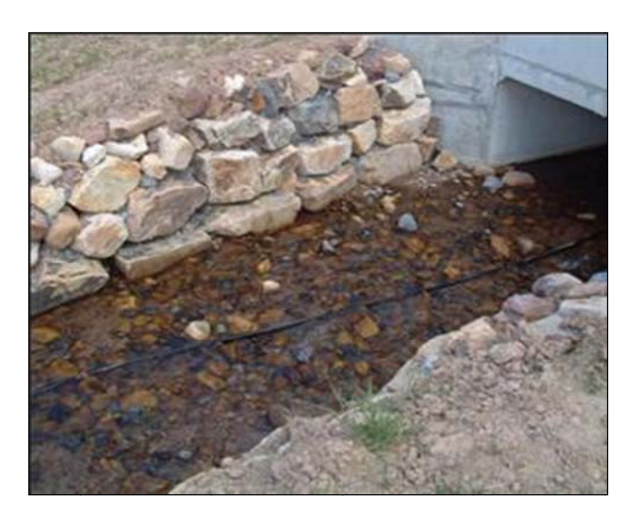
An embedded box culvert sized to match existing stream profile.