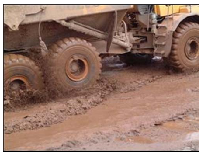
Construction sites require careful management. Is this the optimal haul route in terms of impact minimisation?