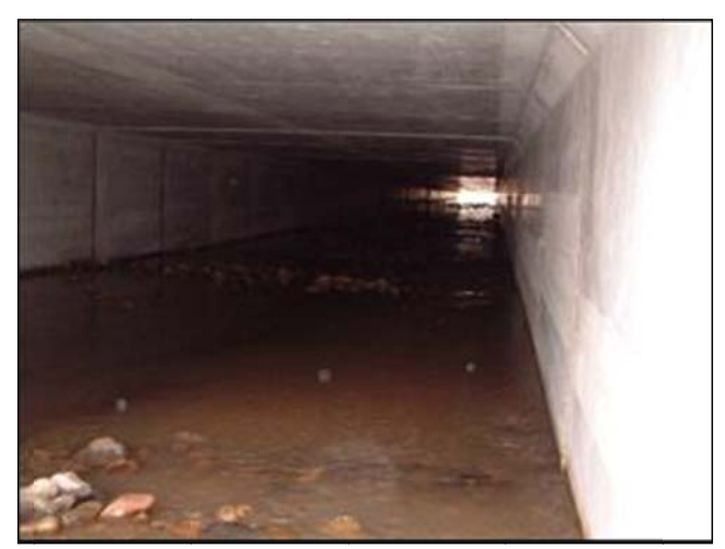
Excessively long culvert resulting in habitat loss and reduced productivity due to inadequate light penetration.

6.3 Bridge foundations should be designed and positioned at least 2.5 metres from the river bank so as not to impact on the riparian habitat.