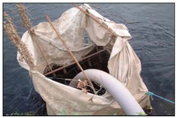
A screened abstraction point using terram fitted over a fabricated support frame.