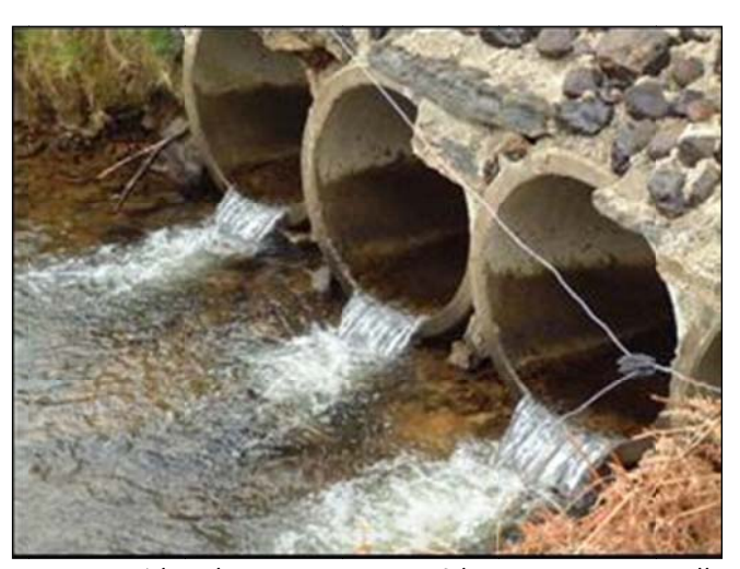
Unacceptable culverting practice. These pipes are totally impassable to fish.

6.12 Pipe culverts are not generally considered acceptable on fisheries waters. They are normally only appropriate for use on minor watercourses and drainage ditches where these can be demonstrated as not being significant in terms of fisheries habitat.