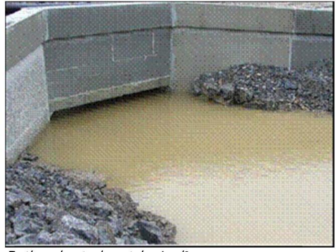
Is the culvert adequately sized?

6.1 Structures should not damage fish habitat or create blockages to fish and macroinvertebrate passage. Design and choice of structure should be based on its technical