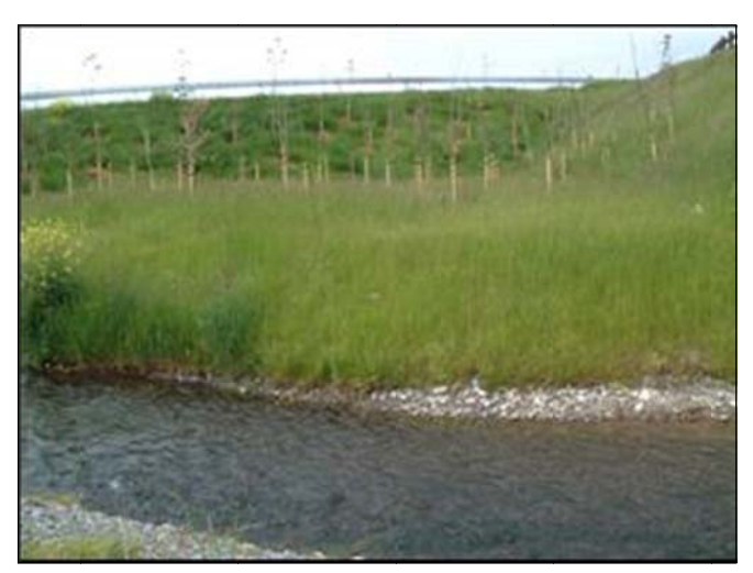
Well vegetated newly established river channel, with broadleaves planted to within 5 meters of the overflow channel. The root structures aid bankside stability.