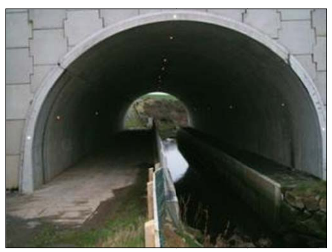
A tidal water with access for vehicles and on the opposite side, access for anglers.