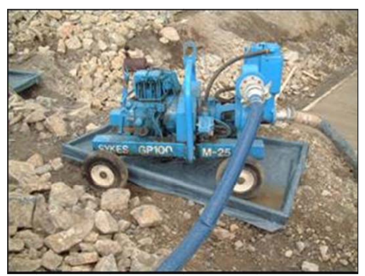
Poor work practice. The drip tray is undersized, constructed of too light a material, and accordingly overly flexible, easily damaged, and unlikely to retain oil residues.