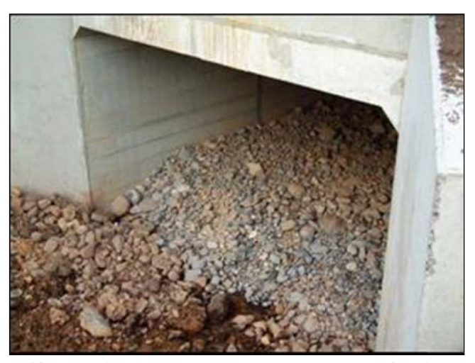
Off-line culvert at construction stage back filled with gravel. The size range and depth of fill required will be site specific.

6.9 Culverts should be positioned where the watercourse is straightest and aligned with its bed.