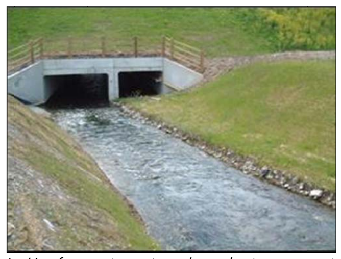
Looking from upstream towards a culvert arrangement. Moderate and flood flows are conveyed in the right hand culvert. Entry to that culvert is dictated by the invert and contour of the right hand portion of the newly created river channel. The left hand bank finished batter angle is approx. 45° The first portion of the right hand bank to convey the moderate flow is battered to approx. 30° The extreme right bank area is battered to approx. 45° to convey flood flows.