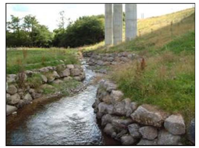
Suitably sized rock armour built to high water level at a location influenced by tidal back-up.

6.14 To facilitate revegetation, each course of boulders laid should be back filled with a layer of top soil. Selection of boulders in terms of shape to facilitate their placement and stability is a major consideration. Irregularly shaped boulders are very difficult to work with in terms of building multiple stable courses.