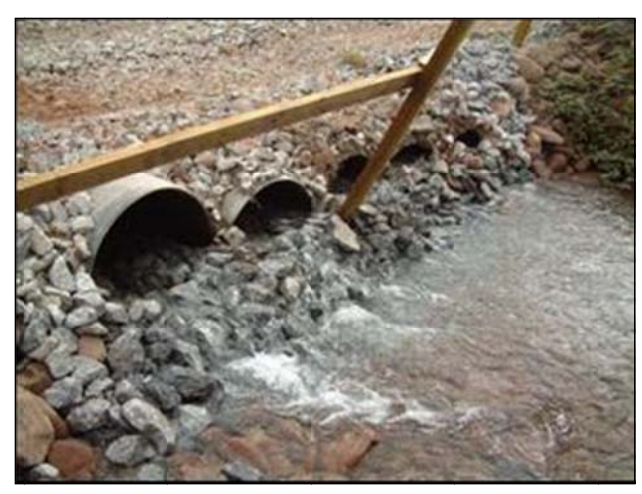
Temporary crossing impassable to fish life.