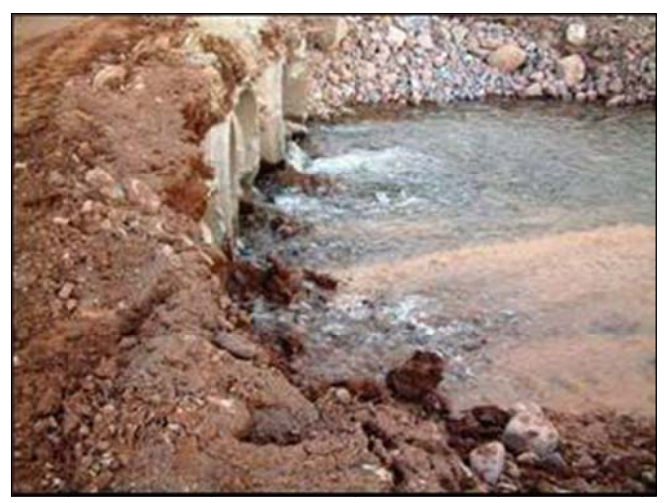
The inevitable result from the crossing shown above. Continuous silt discharges. Unacceptable practice.