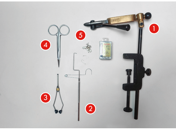
Fly Tying Tools

Vice, 2) whip finishing tool, 3) bobbin holder, scissors, 5) hooks (size 16 - 8).