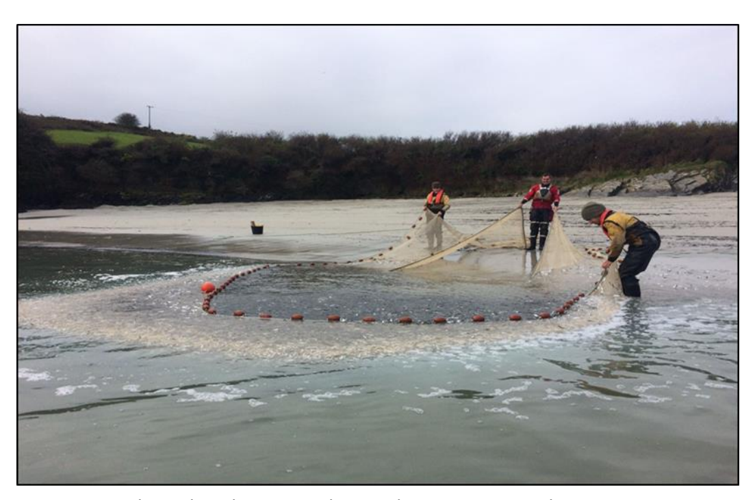
Fig.1.2: Hauling a beach seine in the Bandon Estuary, October 2016.

Beach seining is conducted using a 30m x 3m net (10mm mesh size) to capture fish in littoral areas. The bottom of the net has a weighted lead line to increase sediment disturbance and catch efficiency (Fig. 1.2). Fyke nets (15m in length with a 0.8m diameter front hoop, joined by an 8m leader with a 10mm square mesh) are used to sample benthic fish in the littoral areas. Beam trawls are used for sampling benthic fish in the littoral and open waters, where bed type is suitable. The beam trawl measures 1.5m \times 0.5m , with a 10mm mesh bag, decreasing to 5mm mesh in the cod end. The trawl is attached to a 20m tow rope and towed by a boat. Trawls are conducted along transects of 100 - 200m in length. Sample sites are selected to represent the range of geographical and habitat ranges within the water body, based on such factors as exposure/orientation, shoreline slope, and substrate type. A handheld GPS is used to mark the precise location of each site.