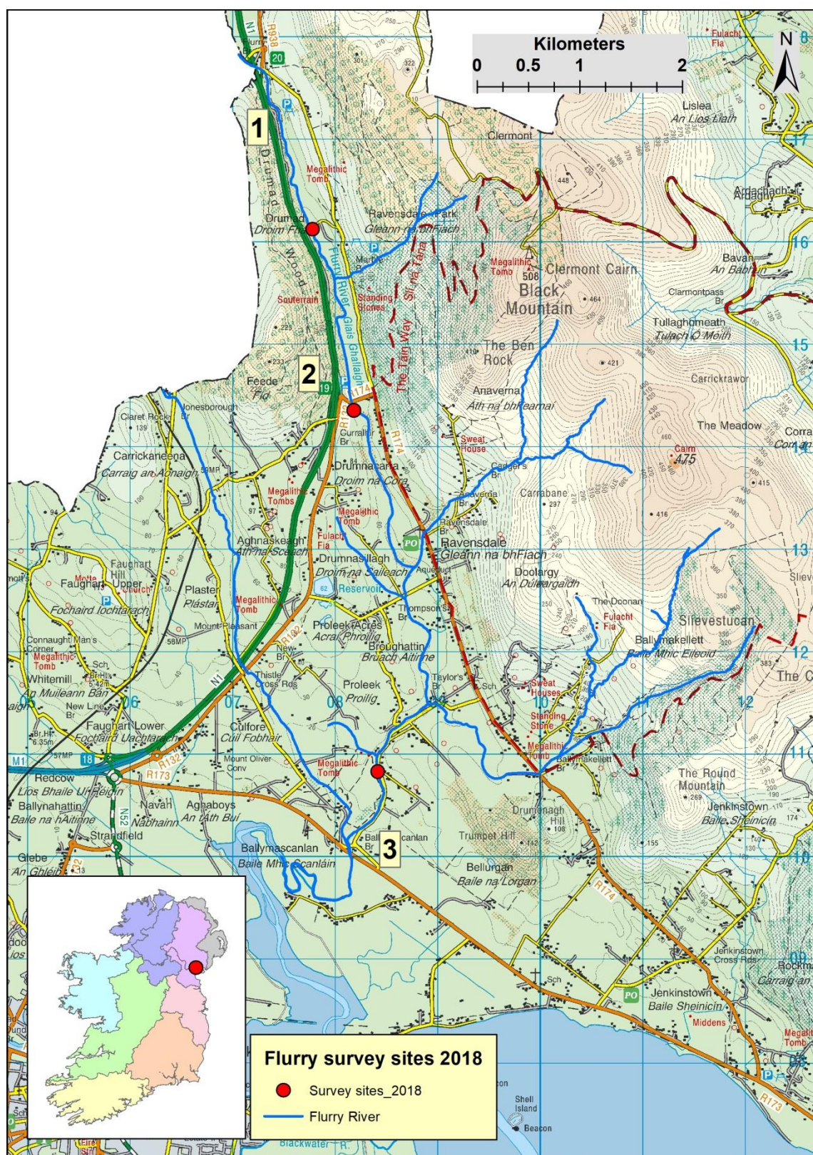
Fig 1 Map of Flurry River catchment electrofishing survey sites, 2018