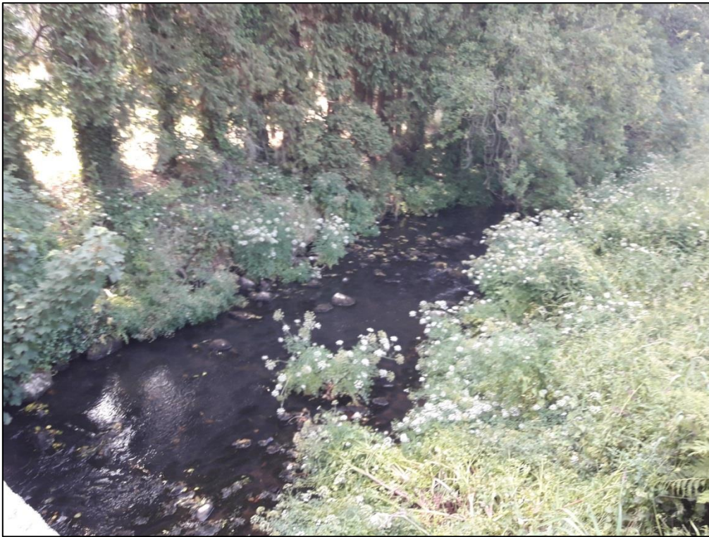
The Flurry River at Drumad, Co. Louth (site 1)

Three sites were surveyed on the Flurry River catchment on the 3rd July 2018.