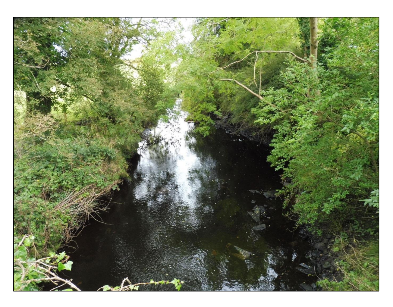
The Inch River at Kilmaley Bridge (Site 2).

Three sites were surveyed on the Inch River catchment on the 19<sup>th</sup> of September 2017.