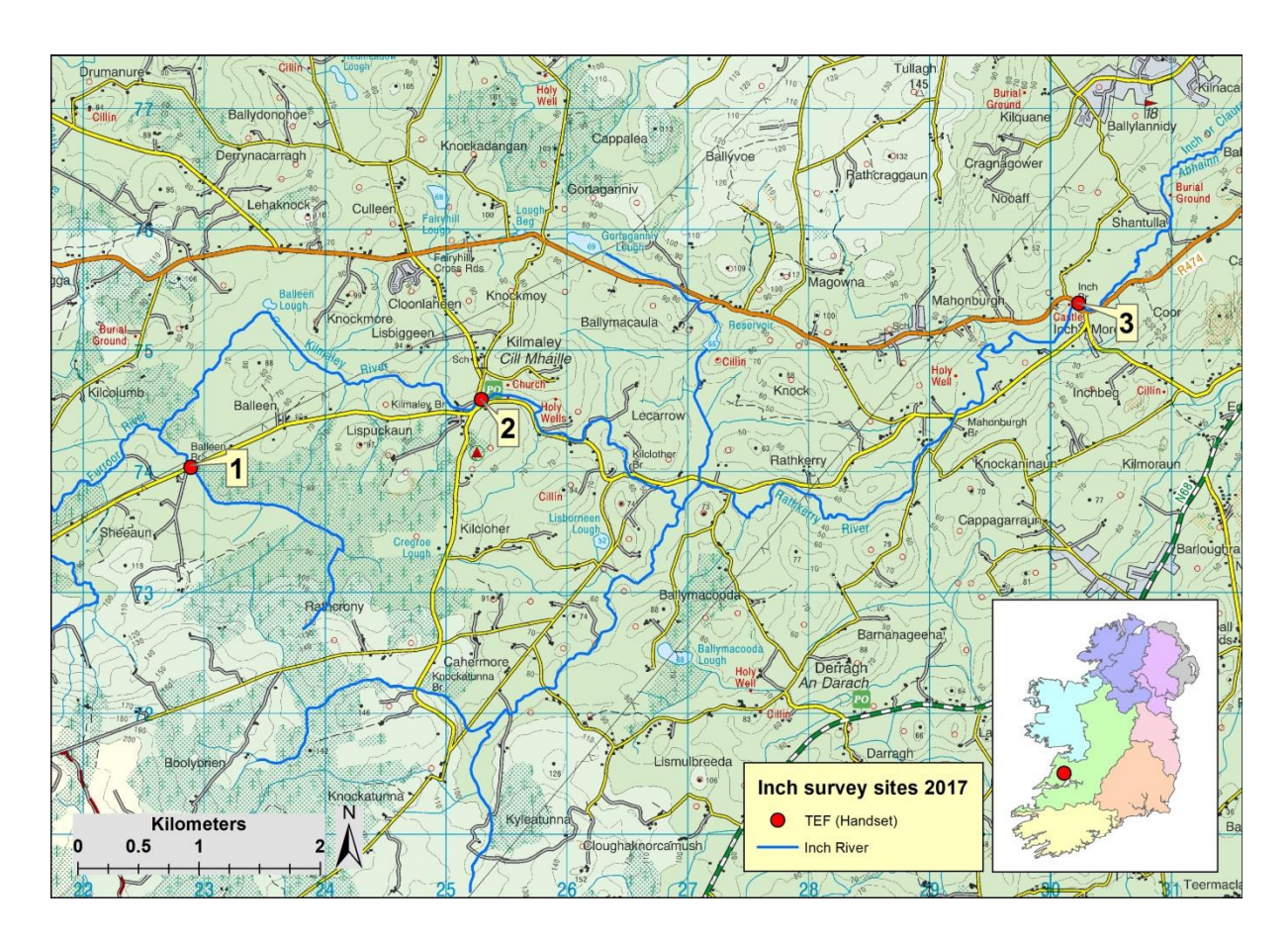
Fig 1. Map of Inch Catchment electrofishing survey sites, 2017