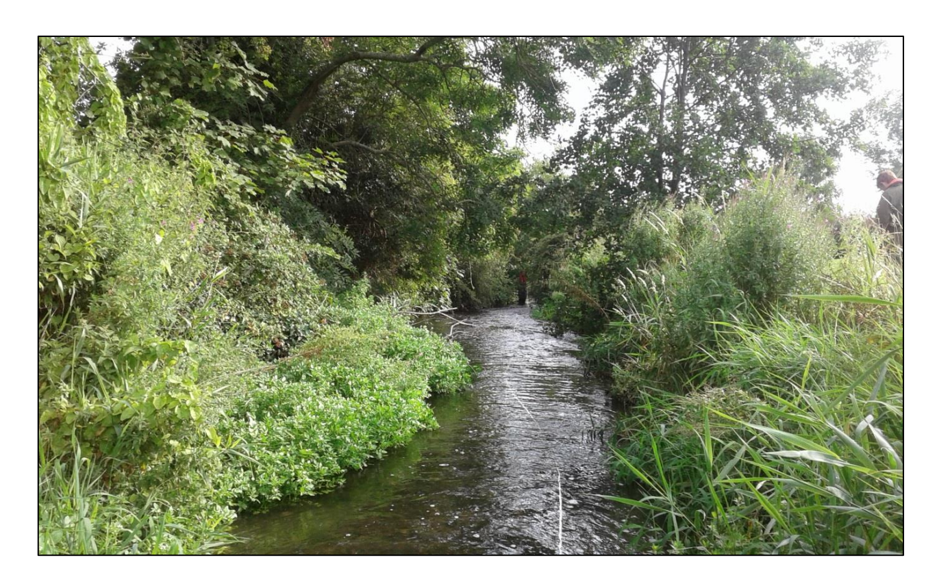
The Camac River at Corkagh Park (Site 2).

Five sites were surveyed on the Camac River Catchment between the 5<sup>th</sup> and 6<sup>th</sup> of September 2017.