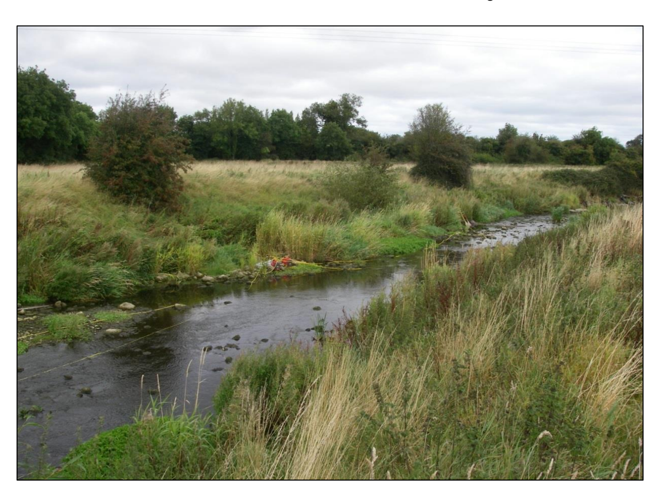
The Broadmeadow River at Lispopple Br. (Site 3)

The Ward River is located within the Eastern River Basin District and covers an area of approximately 62km<sup>2</sup>. The Ward River flows in an easterly direction, joining the Broadmeadow River, just north of Swords, before entering the sea at the Broadmeadow Estuary. The geology of this catchment is limestone, with the main land use type being agriculture. The lower end of the catchment has significant urban development. Six sites (nos. 7 to 12) were surveyed on the Ward River between the 14<sup>th</sup> and 16<sup>th</sup> of August 2017.