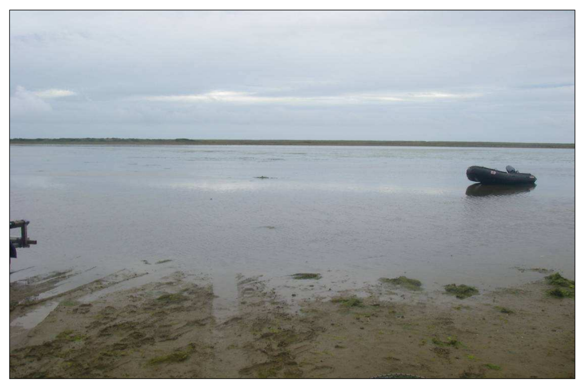
Plate 1.1. Tacumshin Lake, with spit in the background