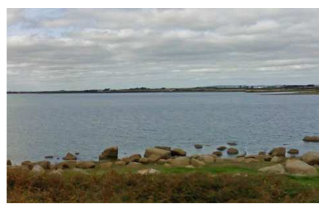
Plate 1.1. Lady's Island Lake, September 2009