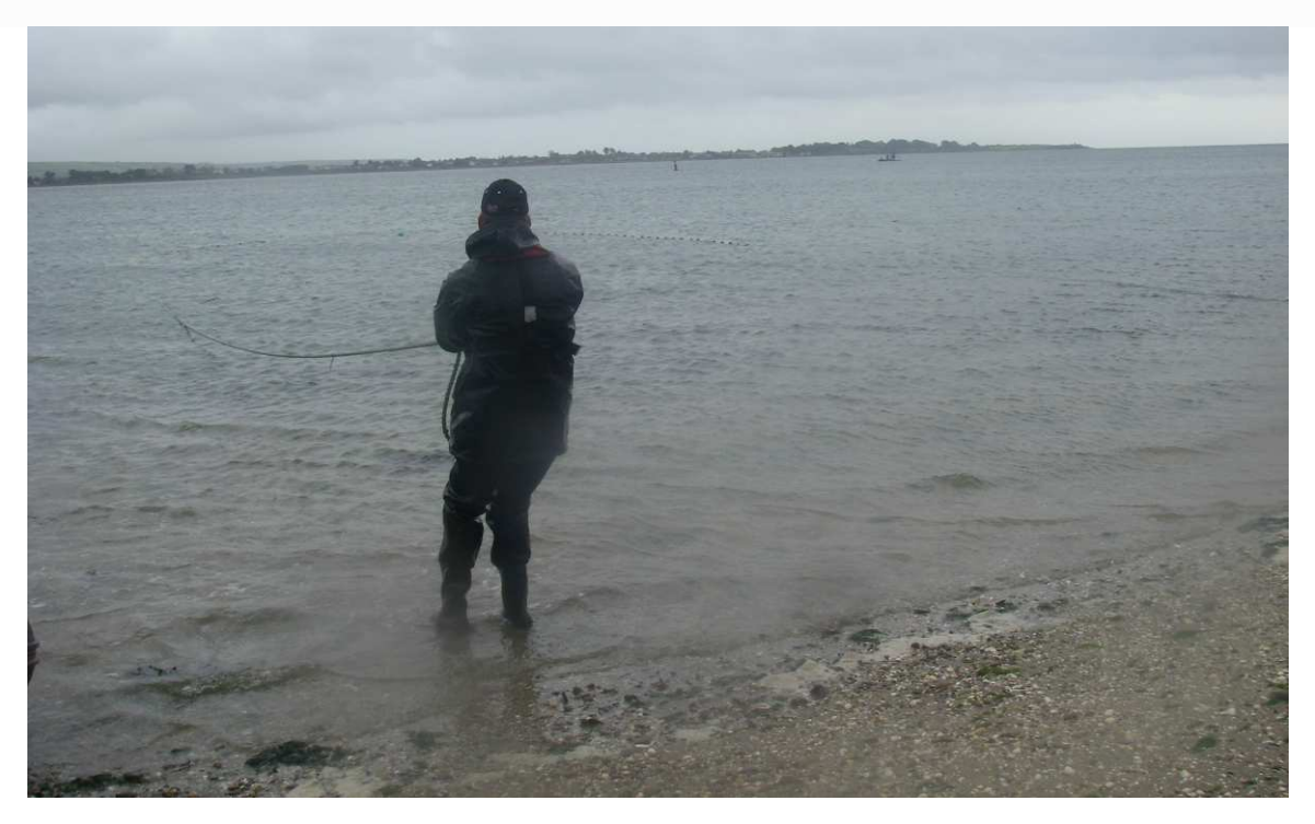
Plate 2: Beach seining the Colligan Estuary with the Southern Regional Fisheries Board, October 2008