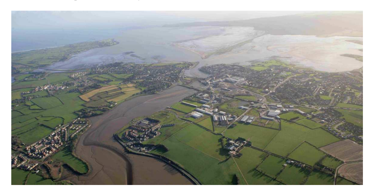
Plate 1: Aerial photo of Dungarvan town and the Colligan Estuary at low tide.

The estuary is subjected to anthropogenic impacts from the town of Dungarvan with its associated sea walls in the inner part of the estuary. The sand flats to the east of the Cunnigar support an extensive oyster farming operation. There is also some commercial exploitation of dogfish and mullet using gill nets in the estuary. This estuary is one of the most important sea angling locations in the southeast with bass and gilt-head bream caught regularly by anglers. The Colligan River is noted for having excellent runs of sea trout. A major part of the ecological importance of the bay is the over wintering birdlife which is present in large numbers. The estuary receives untreated municipal waste water as well as substantial inputs from industry and landfill run-off (Marine Institute, 1999).