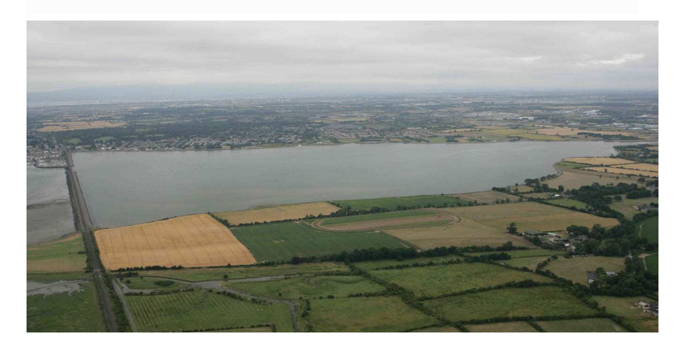
Plate 1: Ariel photo of Broadmeadow Water Estuary (railway viaduct is visible on the left of the photograph).