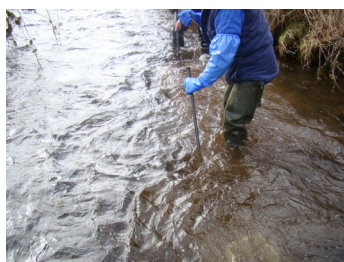
Securing an artificial redd in the substrate on the river Bunowen, County Galway.

Two sub-catchments on the River Suck were eventually selected for the common