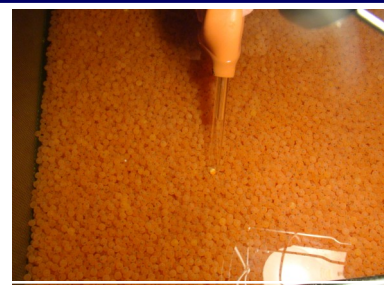
ESB fisheries staff monitored the salmon eggs on a daily basis, removing any dead eggs as a bio-security measure. This stage of development, with the dark spots in the eggs, is known as the 'eyed egg' stage.

Salmon eggs are quite robust at the 'eyed egg' stage and prior