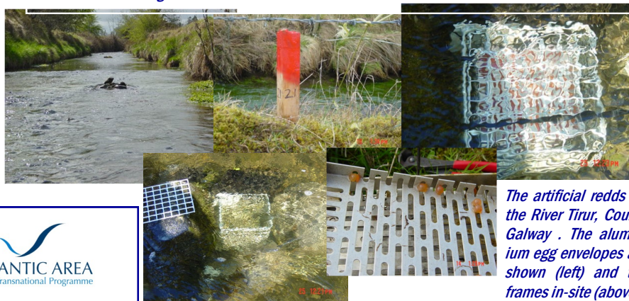
The artificial redds on the River Tirur, County Galway . The aluminium egg envelopes are shown (left) and the frames in-situ (above).