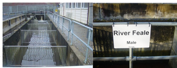
Eggs were placed into aluminium envelopes (horizontal units in photo above) which were then slotted into aluminium frames. Below: holding facilities in the ESB Parteen Hatchery, County Tipperary.

before the eggs were inserted into the rivers.